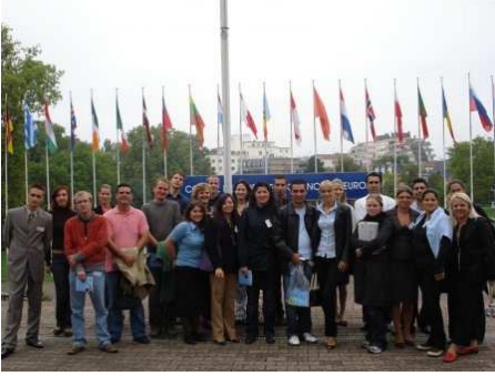
Demographic changes: challenge for Europe

Study session for young unionists from Europe was organized by the ETUC in the Youth Centre of the Council of Europe on 8-13 September, in Strasbourg. This year the study session was extended to participation of young unionists from the PERC region.