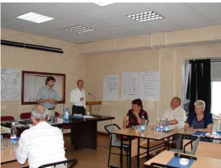
PERC, ACTRAV, GUF, IPEC and Federation of Kyrghizstan Trader Unions Join Efforts to Eliminate Child Labour, Bishkek, July 15-18

Interestingly enough that while looking for the most effective scenario of cooperation in CL elimination both sector unions and FPKg leaders came to conclusion that current structure and functions of the unions require basic changes and that union capacity building element should be integral part of the