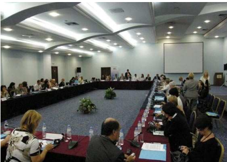
Global March Against Child Labor Pan –European and Maghreb region, Sofia, 15 to 18 September

The conference of the Global March Against Child Labor Pan - European and Maghreb region took place in Sofia from 15 to 18 September.